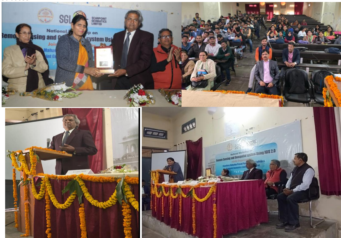
Two Days National Workshop on "Remote Sensing and Geospatial System Using IGIS 2.0"

The presence of faculty members and the enthusiastic participation of students made the event a success.