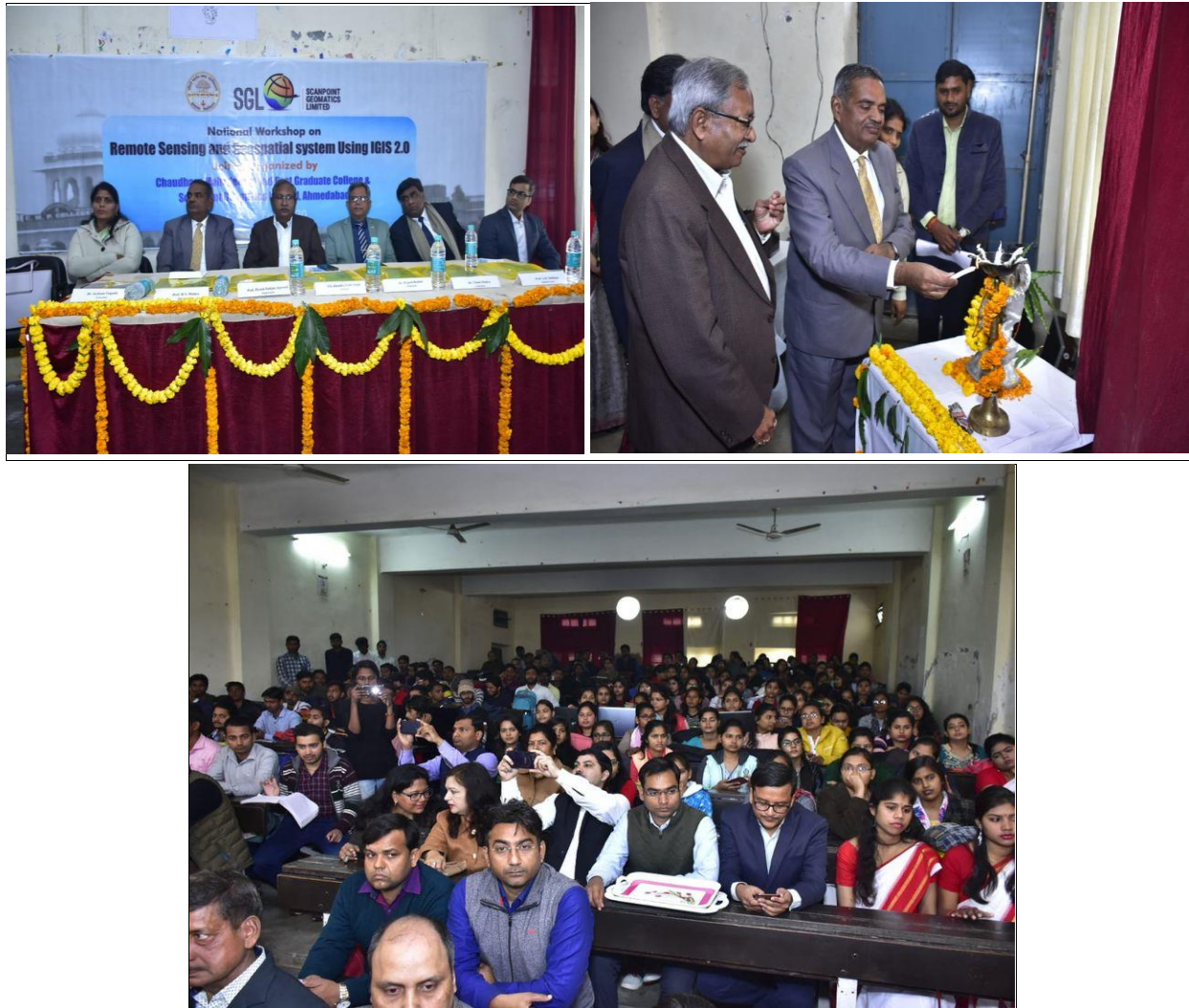
National Workshop on "Remote Sensing and Geospatial System Using IGIS 2.0" in collaboration with Scan-point Geomatics Limited, Ahmedabad