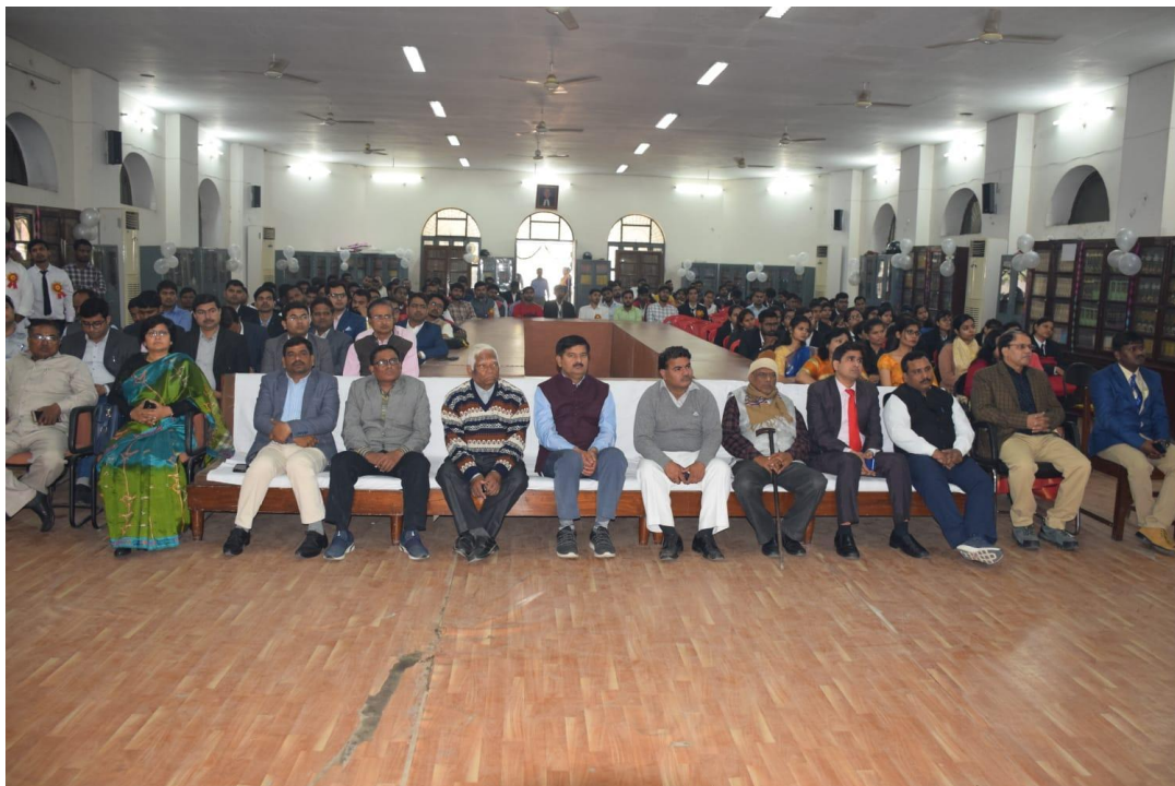
Image:- At National Seminar on the topic Child Rights- Issues and Challenges