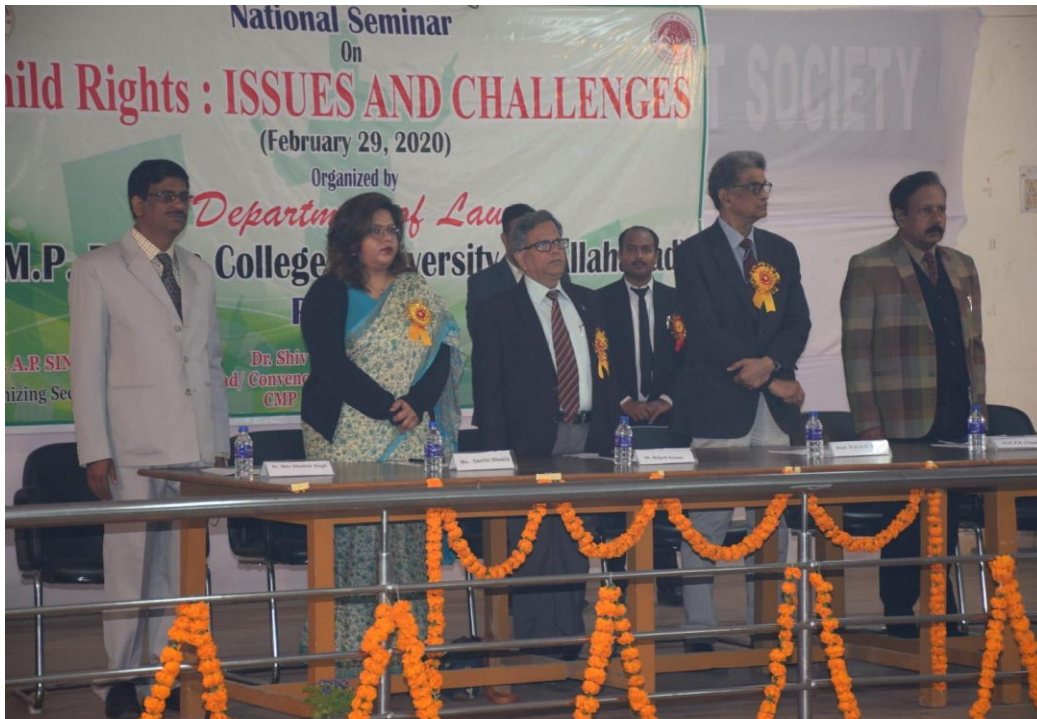
Image:- At National Seminar on the topic Child Rights- Issues and Challenges