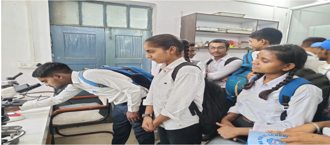
Botany Lab Visit by Students