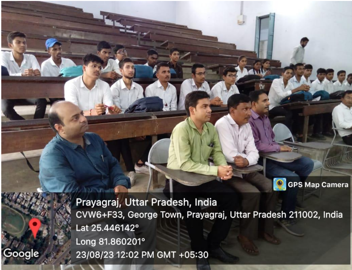
Induction Program of One Day Lab Visit

Outreach Activity of B.Sc. Bio Students Conducted by Botany Department, CMP Degree College, Prayagraj (Under the Aegis of DBT Star College Scheme) on 22 nd September 2023.