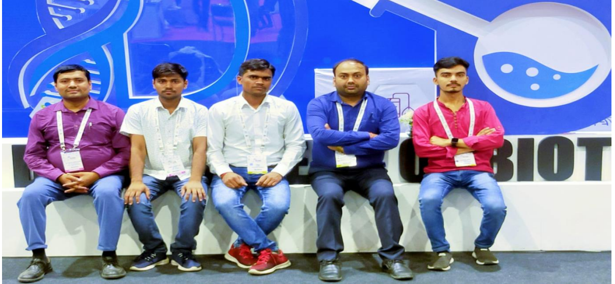
DBT Expo, Pragati Maidan, 10 th June 2022

Out Reach Activity of B.Sc. I, II and III year Bio Students to BSI, Central Circle Prayagraj