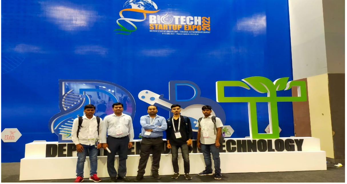
DBT Expo, Pragati Maidan, 9 th June 2022