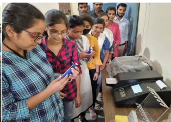
Hands-on Training workshop organized under the aegis of DBT Star College Scheme