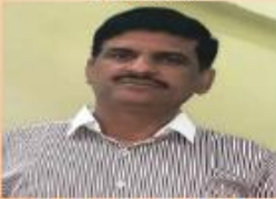
Dr. Shiv Shankar Singh Legal Aid Clinic & Services Clinic, C.M.P. Degree College, Prayagraj.