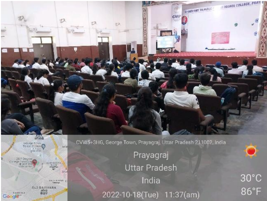
Workshop on Research Methodology organized by the Department of English