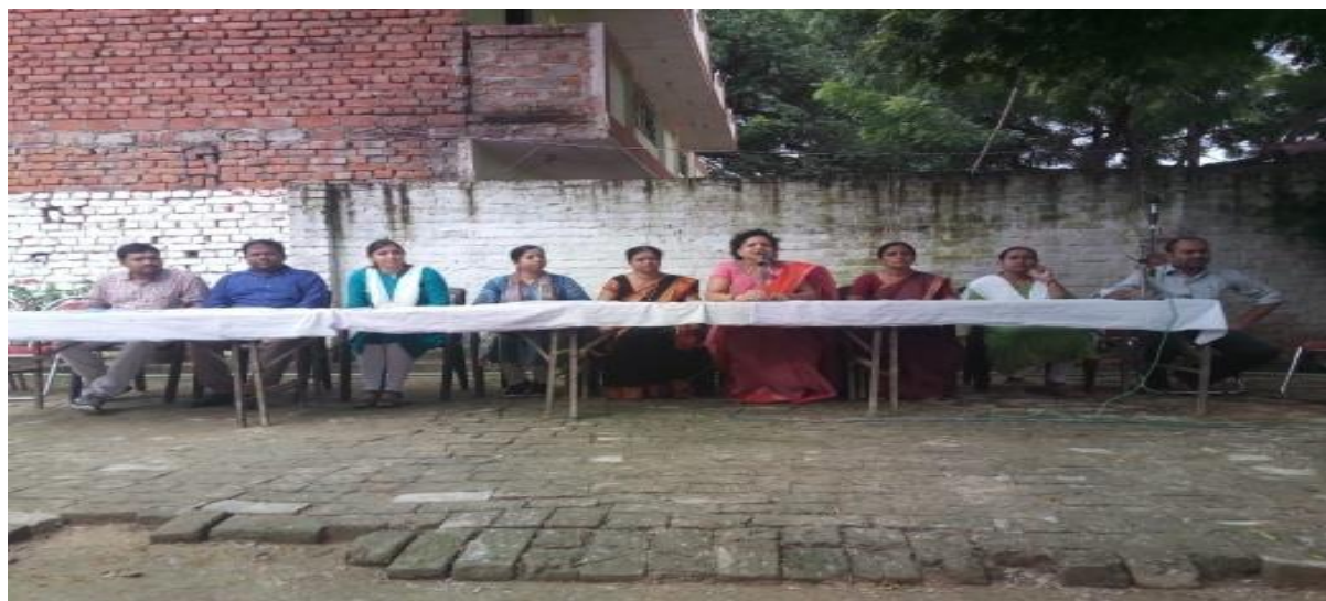
The Department of Botany, CMP has adopted a village near Allahabad and organised a training program on cultivation of mushrooms and medicinal plants.