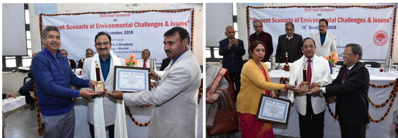
A one day National Seminar was organized by Chemistry Department, CMP on “Present scenario of Environmental Challenges & Issues” on 16 th Dec. 2018 in CMP Degree College