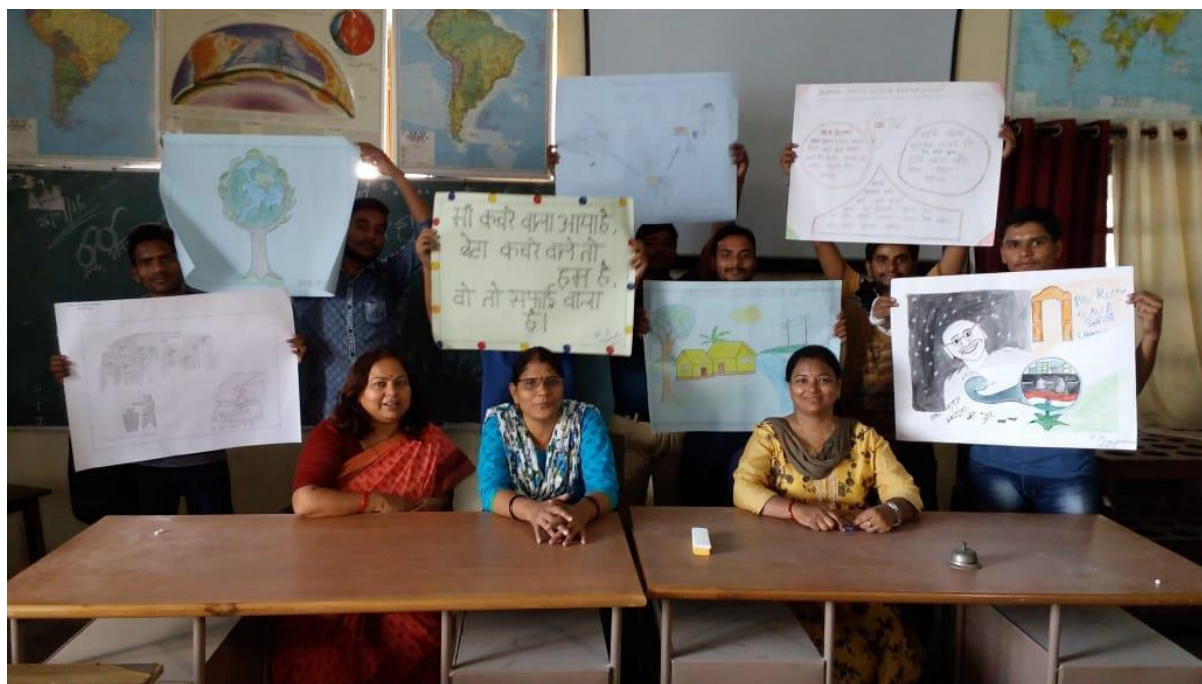
Poster Competition by Geography Deptt.