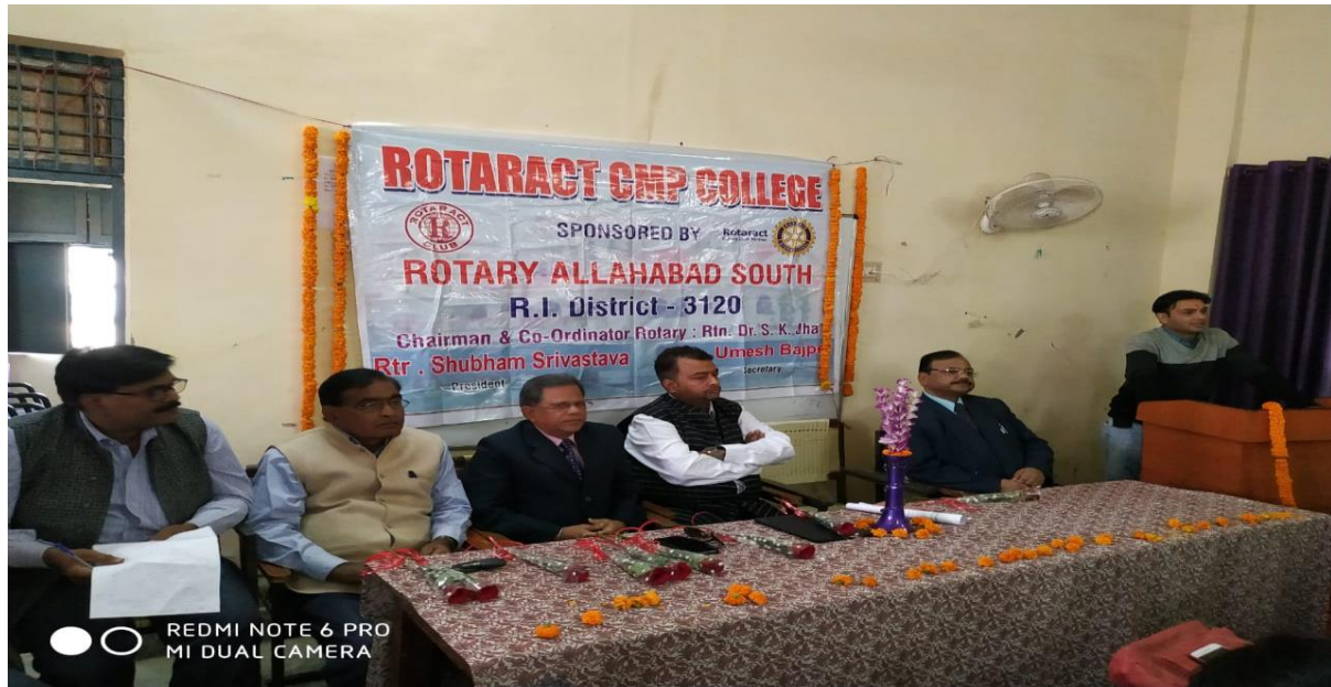
Invited talk (Commerce Department)