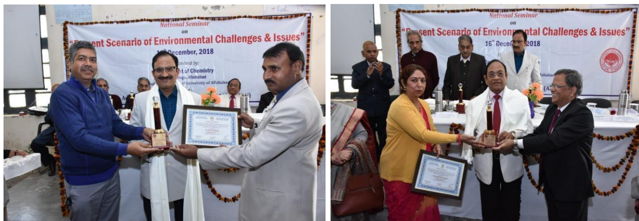
A one day National Seminar was organized by Chemistry Department, CMP on “Present scenario of Environmental Challenges & Issues” on 16 th Dec. 2018 in CMP Degree College