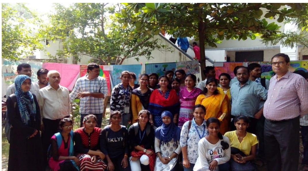
Poster Competition of UG Students