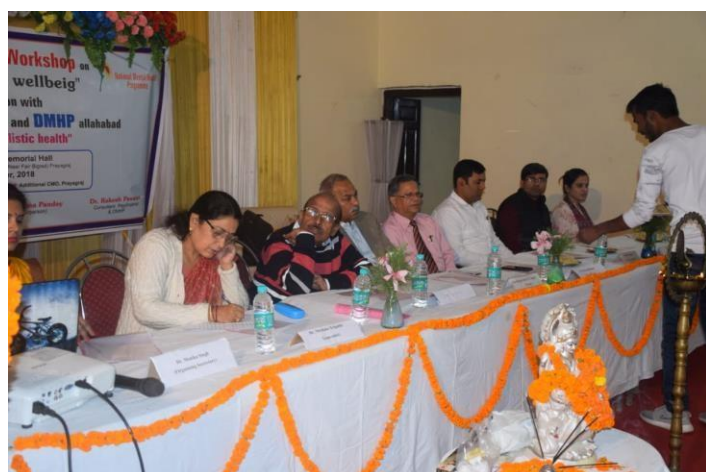
one day National Seminar on “Psychological Wellbeing” was organized by Department of Chemistry in collaboration with DMHP, Govt. of India