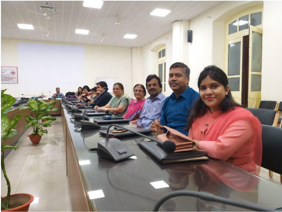
College teachers Attended MHRD Workshop