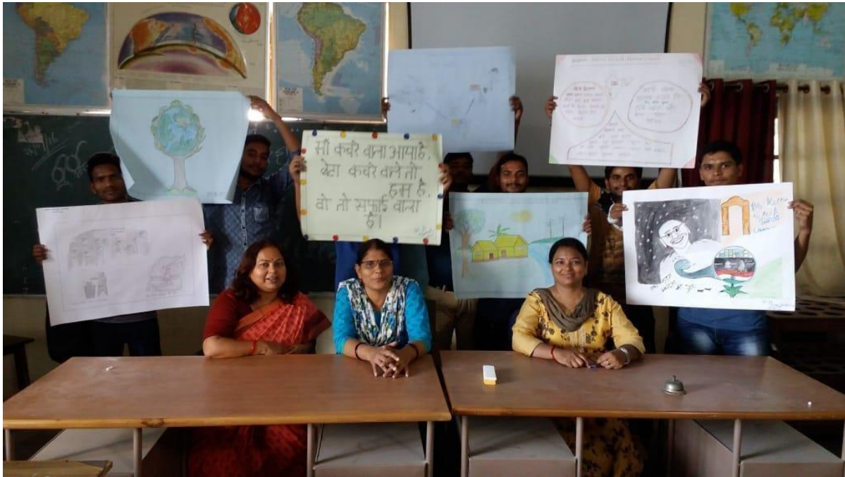
Poster Competition by Geography Deptt.