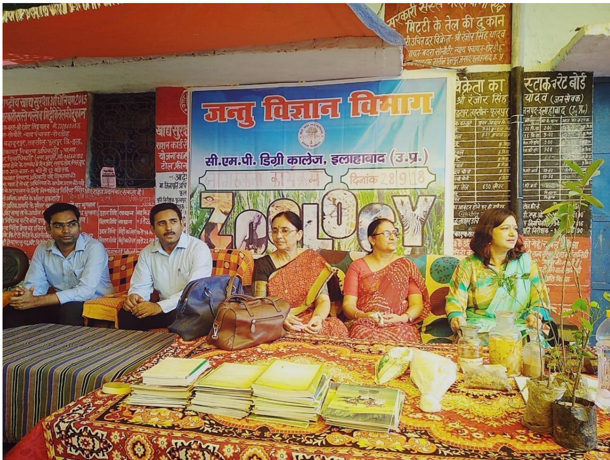
Awareness Program in village by Zoology Department, CMP