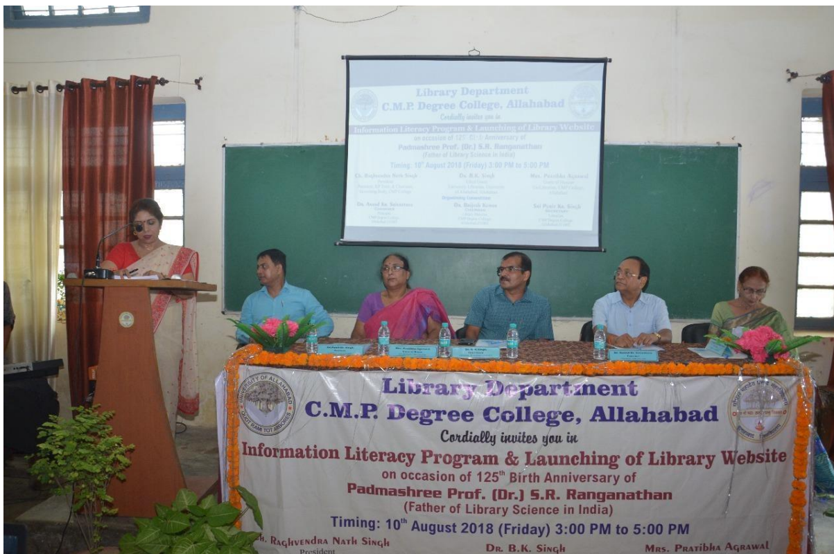
Library website launching programme