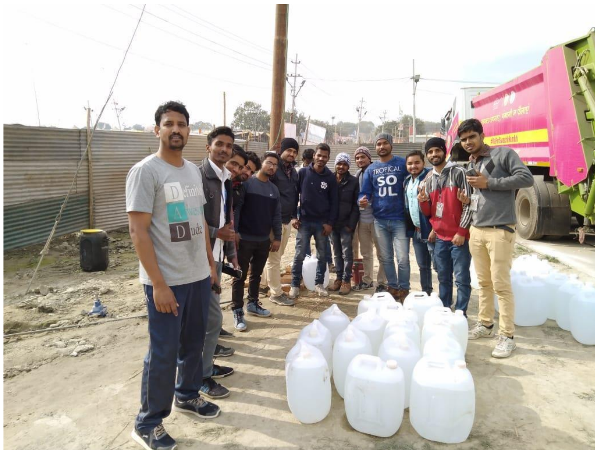
M.Sc. Chemistry and Zoology students worked to maintain sanitization in MahaKumbh 2019