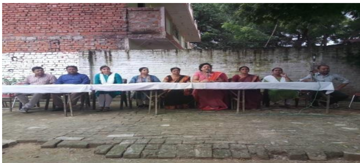
The Department of Botany, CMP has adopted a village near Allahabad and organised a training program on cultivation of mushrooms and medicinal plants.