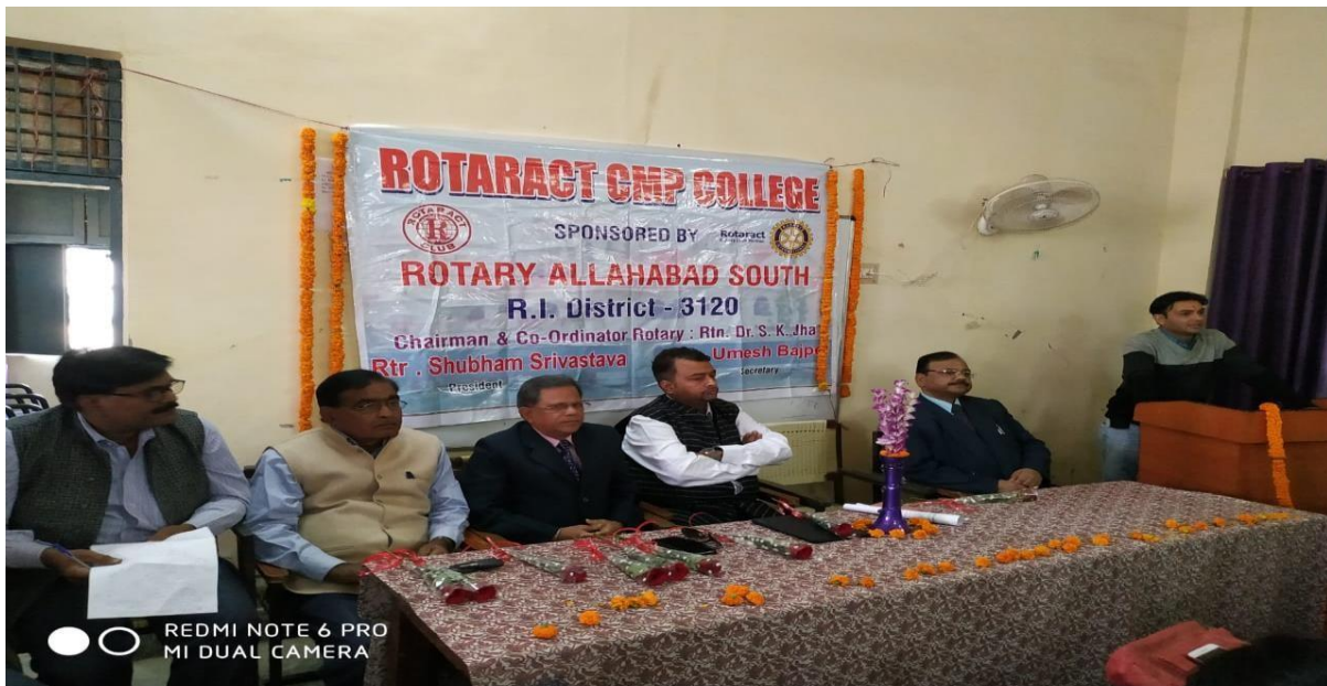
Invited talk (Commerce Department)