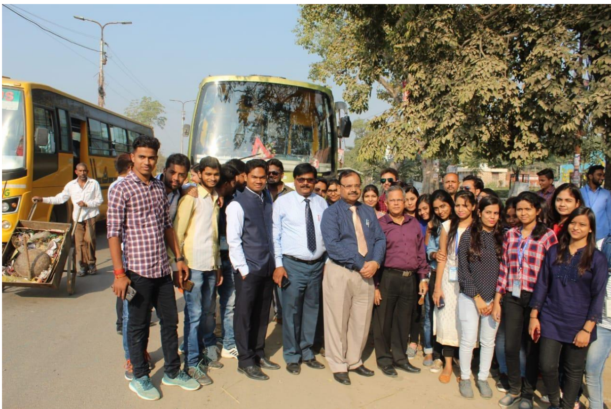
Educational tour to IFFCO by Commerce Dept. CMP